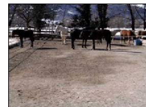
Dry lots and turnouts