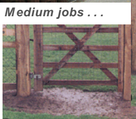
Medium jobs . . .