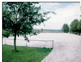
Outdoor/indoor exercise pens or riding arenas