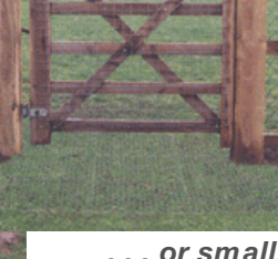
. . . or small.

No special equipment required, often only a one-man-job.