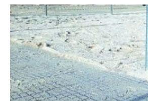
Clean washed coarse sand, buckshot or gravel may be used for a top footing layer, from 3/4" to 1 1/2" deep or more.

HOOFGRID OR HOOFGRID HD? HOOFGRID™ = 1/3 meter square X 3 cm high; load-bearing capacity 25.60 tons /ft².* HOOFGRID HD™ = 1/3 meter square X 5 cm high; load-bearing capacity 35.84 tons / ft²* (*When correctly installed. For all practical purposes, stock cannot damage Hoof-Grid without using power tools ). For most equestrian applications the standard HOOFGRID™ is sufficient. Some climates may require HOOFGRID HD™ . In those cases requiring heavy-duty grids, the extra cost per units is often offset by the decreased: foundation work (sub-base), top layer and maintenance requirements (often none are required). Call us at (310) 413-1739