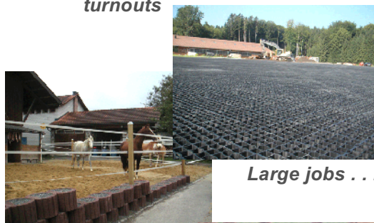
Large jobs . . .