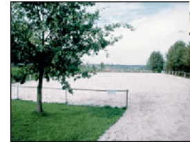
Outdoor/indoor exercise pens or riding arenas