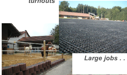
Large jobs . . .