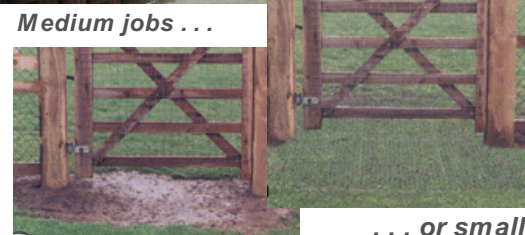
Medium jobs . . .