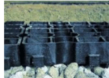
A thin layer of gravel may be required beneath the grids.

Below are three pictures that illustrate the principles and installation. Although a foundation base is not always necessary, prevailing ground conditions affect its proper application. Please contact us for more information.