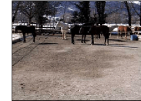
Dry lots and turnouts